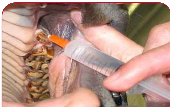
LOCAL ANAESTHETIC BEING INJECTED AROUND A WOLF TOOTH

The risks of root fracture and artery damage can be minimised by effective sedation and local anaesthetic.