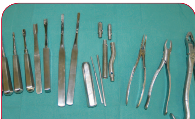
INSTRUMENTS USED FOR WOLF TOOTH REMOVAL

After removal, horses should be given tetanus antitoxin (if not vaccinated) and a period of time off work without a bit being placed in the mouth. This will vary depending on the size of wolf tooth removed but may be as long as ten days.