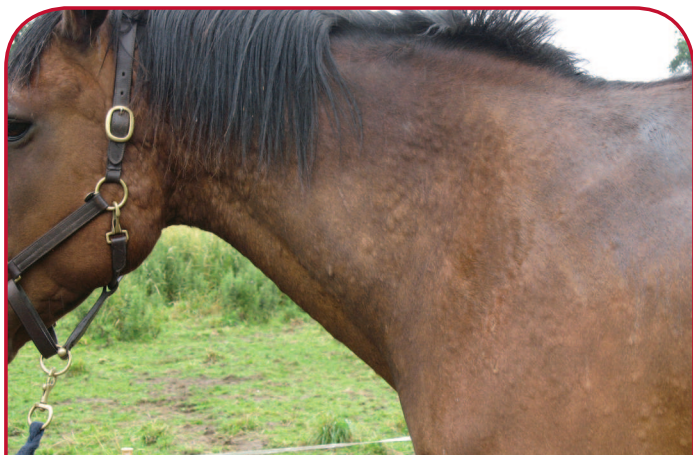
HIVES ON THE NECK