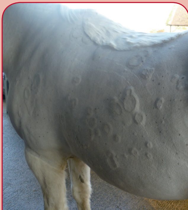
SWELLINGS ON THE BODY